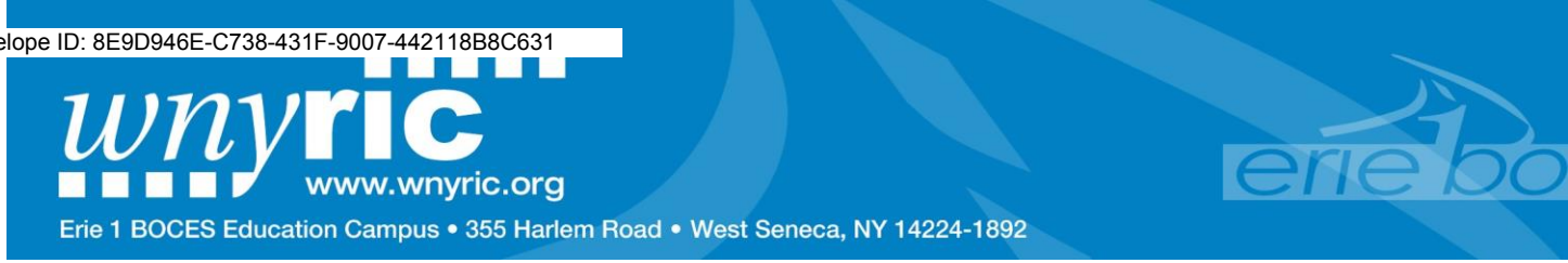
EXHIBIT D (CONTINUED)